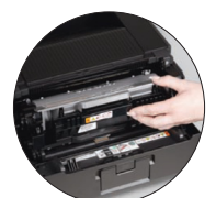
High-yield replacement toner cartridges available**