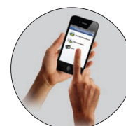
Print via AirPrint™, Google Cloud Print™, Brother™ iPrint&Scan, Cortado Workplace □ and Wi-Fi Direct™